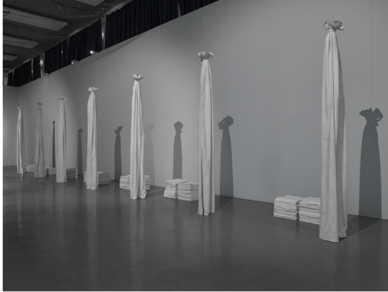
Figure 7 Seven.

endless task of the laundering of bedsheets and the drive to achieve order in the linen cupboard.