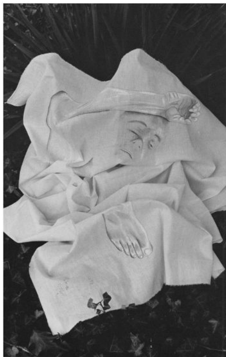
Figure 3 Shroud Ewa Kuryluk. 1983. Photographed in the backyard of Nassau Court, Princeton, New Jersey. Reproduced by kind permission of the artist.

Metaphor is central to the communication and interpretation of unconscious meaning. One therapeutic effect of making the unconscious conscious is the creation of new meanings that expand the sense of the agency of the self. There is then a synergistic effect: with an expanded sense of agency there is also an expanded awareness of the complexity of metaphor, which,