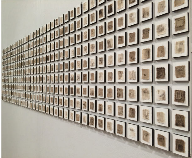
Figure 9 Mendings II.

In my own work, in the piece Seven I have used bedsheets, hanging in the style of shrouds from the seventeenth century. This style of shroud may be familiar as it was used in the sculpture of John Donne in St Paul's Cathedral.