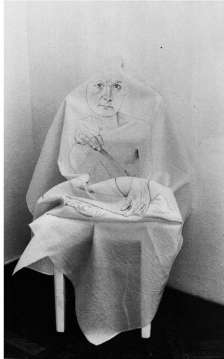
Figure 5 Chairs Ewa Kuryluk. 1982. Reproduced by kind permission of the artist.

The smooth piles of clean bedsheets in the linen cupboard, ironed and folded, speak of purity and order, cleanliness and care. As the poet Collete Wartz has written “Orderliness. Harmony. Piles of sheets in the wardrobe. Lavender in