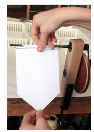
2 (Louet hand bobbin winder)