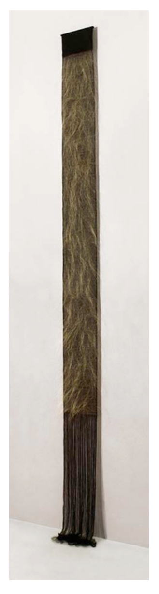
Blonde, 2011 Thread and human hair 87 x 7 x 4 inches Collection Howard and Donna Stone