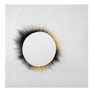
Burst, 2013 Cloth, hair, thread 48 x 48 inches Collection Lori Uddenberg