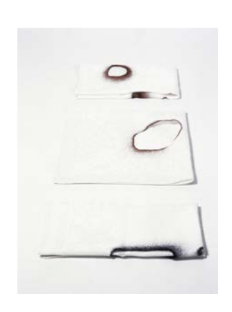
Disrepairs (nos. 1, 2, 3) 1996 Found table napkins, hair, thread