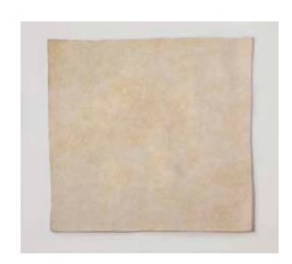
Flaxen, 2013 Linen cloth, hair, thread 46 x 46 inches Collection Howard and Donna Stone