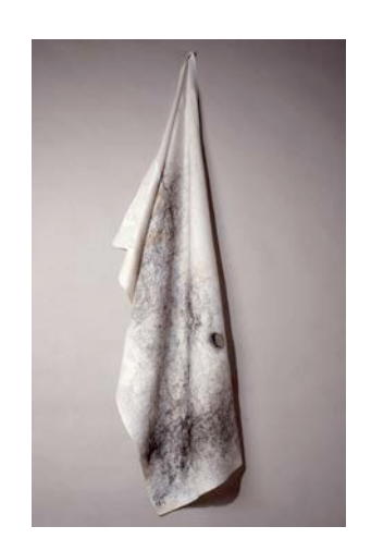
Mourning Cloth (drape), 1992-3 Hair, thread, reconstructed cloth 72 x 32 x 2 inches