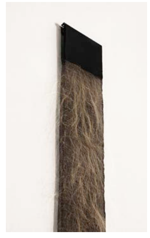
Blonde, detail, 2011