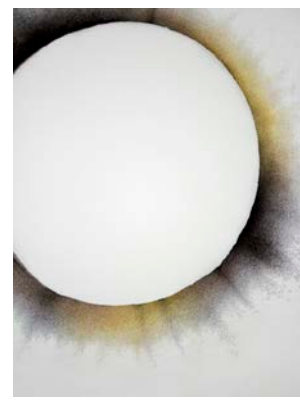
Burst, detail, 2013